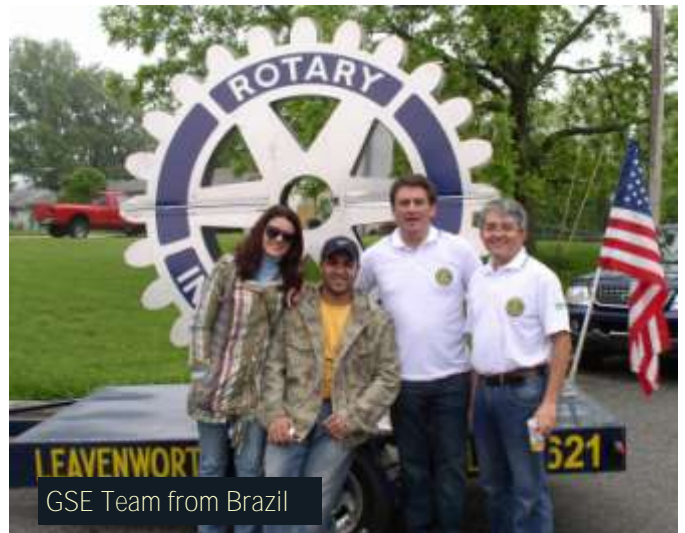
GSE Team from Brazil